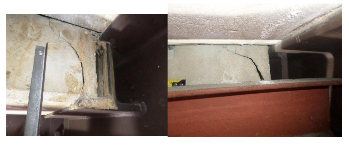
PLEASE NOTE - These are NOT images of RAAC at St. David's Hall

Visual inspections may identify cracking and deflections to exposed and visible areas of RAAC, however, an intrusive survey carried out by a professional structural engineer is recommended to be the only effective method of gaining a detailed insight into condition. The following images illustrate deterioration within RAAC planks that would not be identified from a visual inspection from the underside: